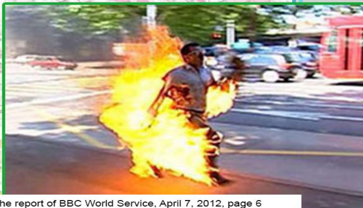
Ref: the report of BBC World Service, April 7, 2012, page 6

During the war, the Mojahedin always carried cyanide pills with them so that they would not be captured alive. The Tamil Tigers , the world's leading suicide bombers, had this method as well.